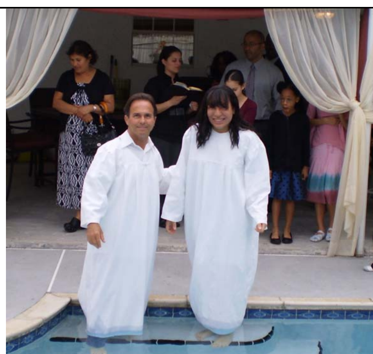
A recent baptism in Orlando, Florida, Feb. 2011.

“Among earth's inhabitants, scattered in every land, there are those who have not bowed the knee to Baal. Like the stars of heaven, which appear only at night, these faithful ones will shine forth when darkness covers the earth and gross darkness the people. In heathen Africa, in the Catholic lands of Europe and of South America, in China, in India, in the islands of the sea, and in all the dark corners of the earth, God has in reserve a firmament of chosen ones that will yet shine forth amidst the darkness, revealing clearly to an apostate world the transforming power of obedience to His law.” Evangelism, p. 166.